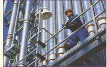
Together, with Parker Hannifin, Sorensen Systems brings system and component solutions to modern power generation facilities including geothermal, wind, solar, nuclear, fossil fuel, gas turbine and combined cycle plants.

Using the latest technologies, the engineers at Sorensen Systems develop innovations to improve emissions performance, minimize waste, meet environmental regulations, monitor air and water quality, offer longer life, and help create greater fuel efficiency. The goal is to increase MW output, reduce operating costs, extend engine and component life, reduce maintenance costs and reduce emissions through greater efficiencies.