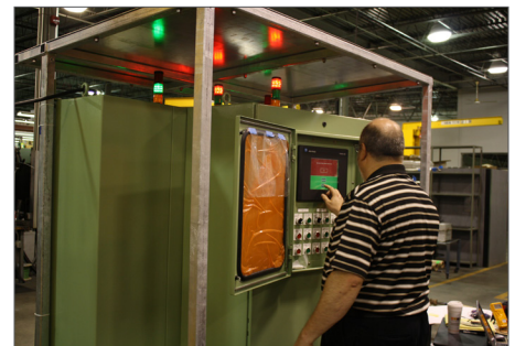
The electronic control enclosure, which was programmed by Sorensen Systems engineers, is equipped with a stack-light assembly consisting of green, amber and red indicator lights, with each light indicative of the overall status of the three pump stations.

lubrication system will automatically initiate an associated Main Pump shutdown. Gate and ball valves monitored by switches are used to isolate each pump unit from the rest of the system. Any combination of pumps may be on or off line without impeding oil flow from other pumps.