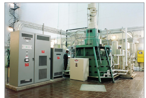
Sorensen Systems built two new digital excitation control systems as part of refurbishment.